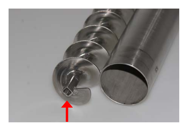
Square Receptacle Auger Photo 9.3