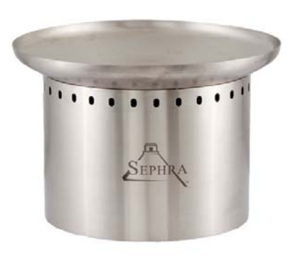
Removable Bowl Photo 9.1