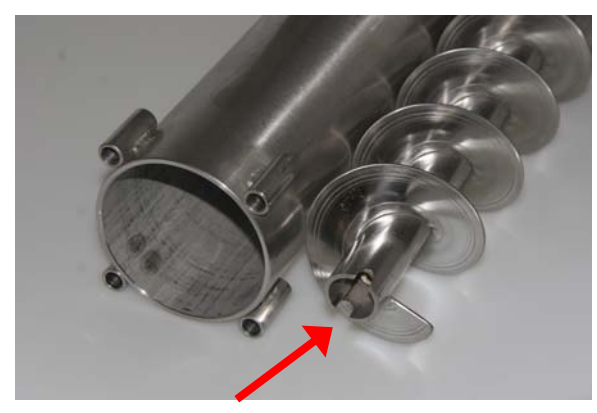
Round Receptacle Auger Photo 9.4

d) Another difference in the two types of fountain is in how the cylinder attaches to the bowl. The removable bowl fountain has a sleeve inside the bowl that the cylinder will slide into (See Photo 9.5 on the following page).